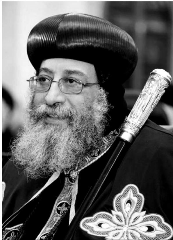
His Holiness Pope Tawadros II

Pope of Alexandria and Patriarch of the Holy See of St. Mark (pope 118)