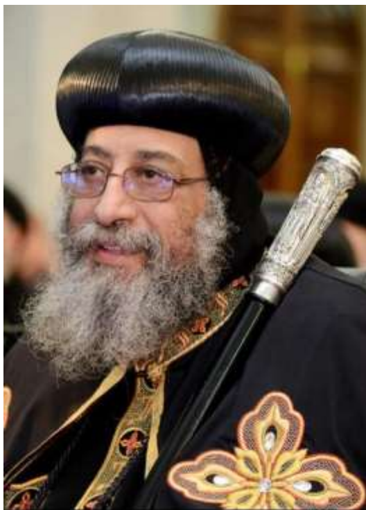
His Holiness Pope Tawadross the second Pope of Alexandria and Patriarch Of the Mercian Evangelism (118)