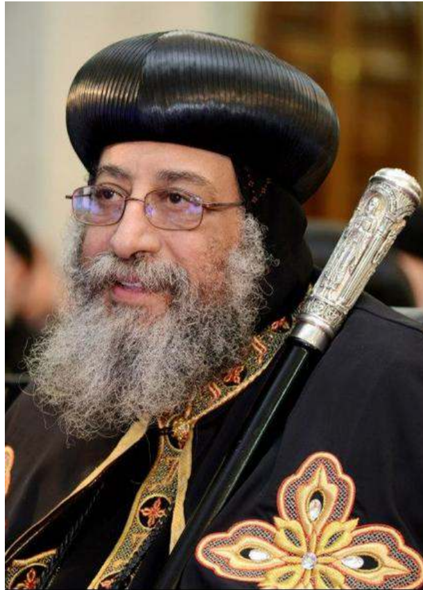
His Holiness Pope Tawadross the second Pope of Alexandria and Patriarch Of the Mercian Evangelism (118)